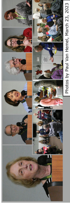
March 23, 2023

Website Quick Links Catalog DocStore Facebook Officials Member Portal Contact Us